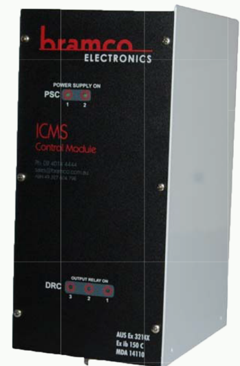
ICMS Control Module

The Digital system on the CCMS provides the Isolation Request function. The MCP central control is our Integrated Control Management [digital control] System [ICMS] which scans the electronic stop control nodes on the system continuously. A switch turned to the isolate position is recorded by the ICMS on its digital scan and a relay [DR2] in the ICMS controller is energised. The CCS station requesting the isolation should be locked out with an appropriate locking device in the isolate position. A danger tag is to be attached to the lock.