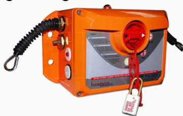
BK400S: locked in Isolate Position

The Bramco system will accommodate any number of drive stations on long conveyors. The system just described is the basic single drive configuration. Every drive mechanism on a conveyor has to be isolated. The isolation must include the weight towers when used, winch take up units, dual or triple drive units. The conveyor must not move at all whilst people are in close contact during maintenance activities. The power must be removed from every motor which implies tension of any form to the conveyor. The tripped state of every electrical switching device used to supply power to any and all drives must be connected correctly and checked before the input to the ICMS signalling "Isolation is completed" is supplied to the ICMS unit.