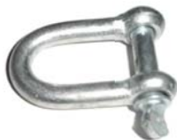
D-SHACKLE Order Code: H70056