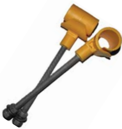
PIGTAIL Order Code: H70235