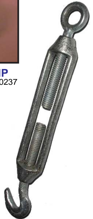
TURNBUCKLE Order Code: H70059