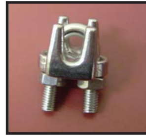
ROPE CLAMP Order Clamp: H70237