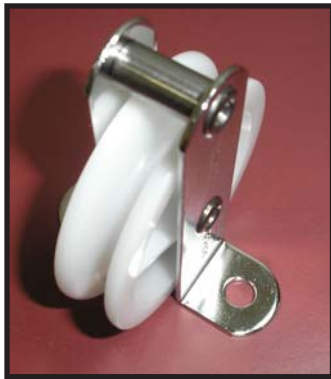
PULLEY Order Code: H70238