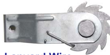
Lanyard Wire Strainer Order Code: H70366